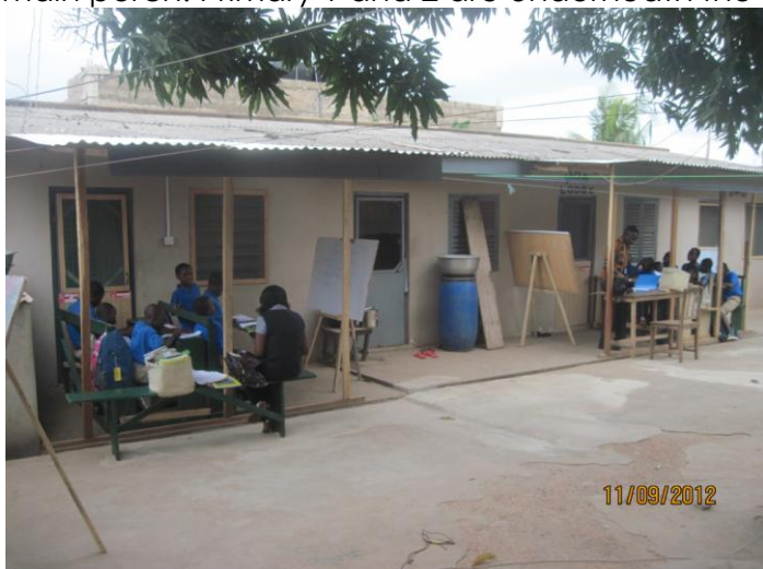
MOP Primary 3 and Primary 4 classes are now located beneath newly constructed awnings.

As MOP begins its fourth school year since 2009, directors are delighted to see MOP students learning; beginning to read, write and make use of numbers. MOP students are now filled with hope and dreams for each of their futures.