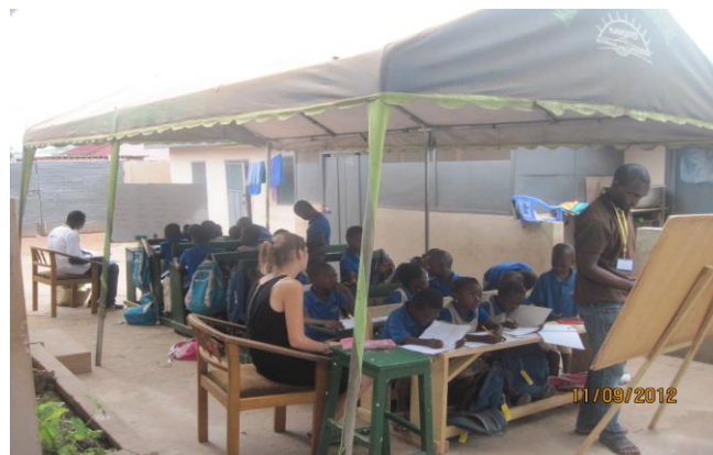
Primary 1 and 2 in class

Classes KG 1 and KG 2 are still located on the main porch. Primary 1 and 2 are underneath the