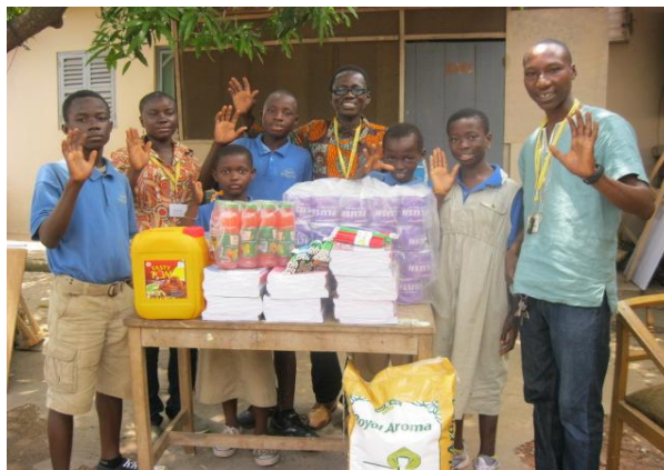
MOP Staff and Primary 4 students stand with the items donated by the Pentecostal University College

Pentecostal University College at Accra Marketing students made their second donation of provisions to Mawuvio's Outreach Programme in late June. The first donation by the Marketing students was made in mid-March when PUC students also gave a presentation to MOP about the importance of education.