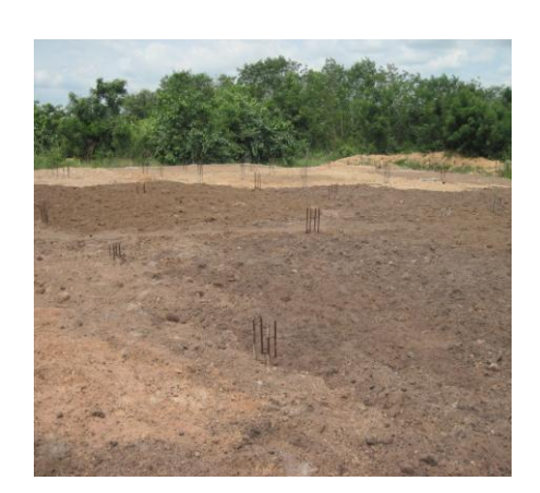
The finished and leveled foundation at Ayikuma Township.

The Ayikuma building project that will soon be the future home and school has begun to take form during the month of September. MOP added a small amount of sand to the filled foundation and then leveled the sand to prepare the building for flooring and bringing up the walls.