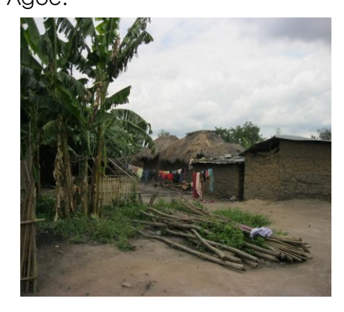
The Ayikuma community that MOP will soon serve

MOP directors Eric Kwame Agoe and Renee Farwell plan to build up and finish two to three rooms and then move in to the unfinished building using the small space as classrooms during the day and dormitories in the evening until the entire building is finished. "Living there will ensure that the work is done as proficiently as possible," stated Agoe.