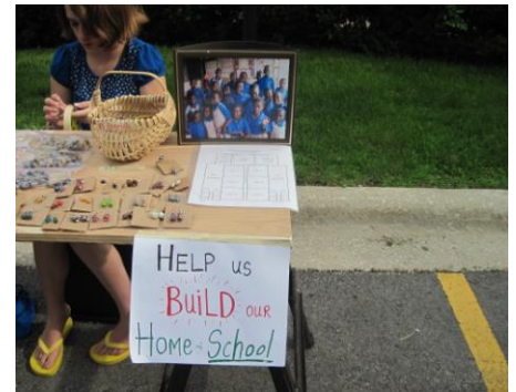
Below: MOP Bead Table