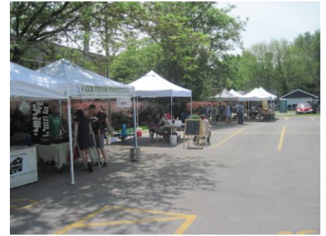
Above: Pilsen Farmer's Market

"It was interesting selling the beads in a big city" said MOP treasurer Barb Farwell. "People were mostly interested in the jewelry and not as much the cause behind them." MOP fared well at the farmers market but wished the community would have been more interested in the work MOP does. "It is always good to sell the beads, but it is best when people realize the purpose behind them as well."