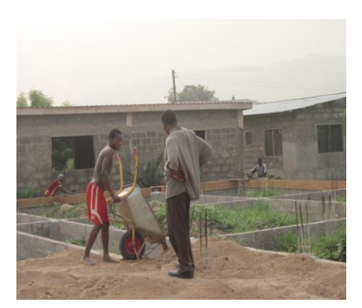
Spring 2011 community members & volunteers worked together filling the building foundation.