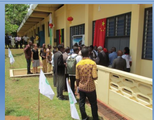
Ribbon Cutting Ceremony of the Chinese Intercultural Center at Ho Polytechnic

Following the speeches, a ribbon cutting was held at the new China – Ghana Intercultural Center. A reception followed at a nearby restaurant. MOP was honored to be invited to attend the programme representing the NGO sector. All attendees were excited for the installation of the center at Ho – Polytechnic. The only other Chinese language learning center is located at University of Ghana Legon – Accra. With more and more Chinese coming to Ghana, Ghanaians are excited to have the opportunity to learn Chinese to strengthen the bond between the two countries.