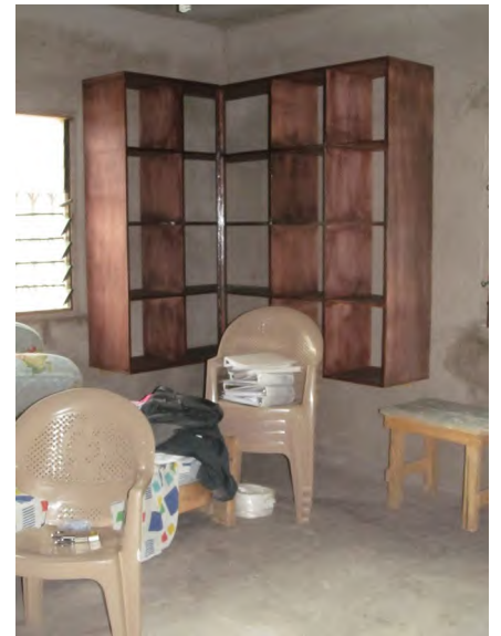
New shelving units inside the school. ^

They've also had some time to visit with the kids and, of course, with Renee.