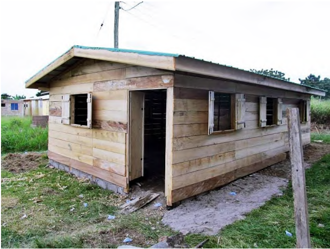
The new school's new

But along with the added responsibility, will come the removal of many challenges M.O.P. has been dealing with for years. The rain will no longer interrupt class-time. Students will have bathrooms to use just down the hallway. All of the students will be well-fed and better focused. Sleeping and security conditions will be more comfortable and safe for many of our students. And, maybe most excitingly, they will have space to hang out, garden, and play!