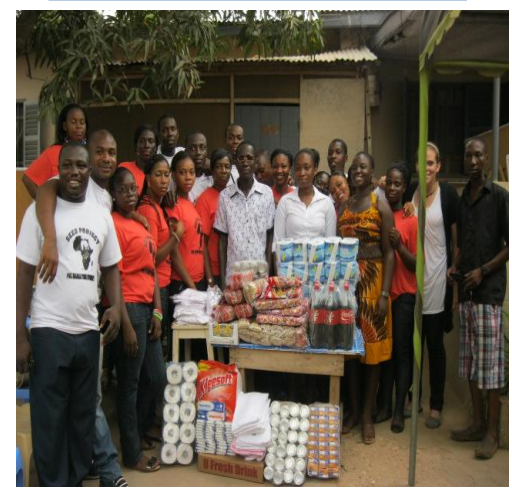
MOP Staff accepts donations from PUC students on behalf of the MOP students