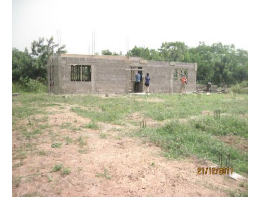
the front room at Ayikuma completed up to ceiling level.

completed along with the front room. The front room has been built up to ceiling level. Mawuvio's Outreach directors are working together with MOP supporters to raise the funds needed to be able to cast the concrete ceilings. At this time Mawuvio's Outreach building progress is experiencing delays due to lack of funding. All supporters are encouraged to assist in whatever way they can.