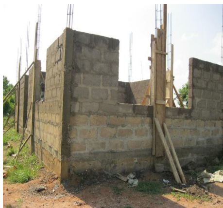
setting the pillars of the corner of the front room

ceiling of the front room will be laid. The ceiling will also serve as the floor of the second story in the future. Mawuvio's Outreach directors, board and supporters are very pleased and encouraged to see the building begin to come up. Directors hope that the building can continue to grow at this rate until completion. Supporters are encouraged to assist in the building fund however they can.