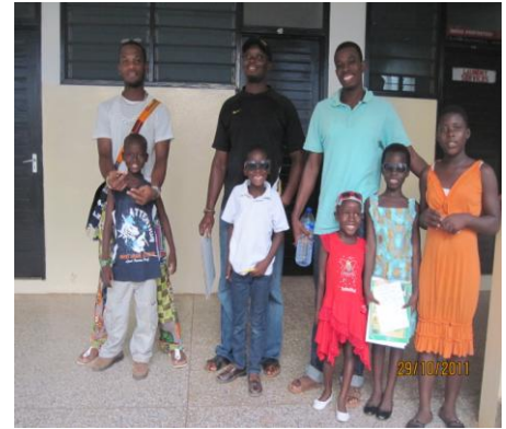
A group of MOP students stand with their Saturday tutors