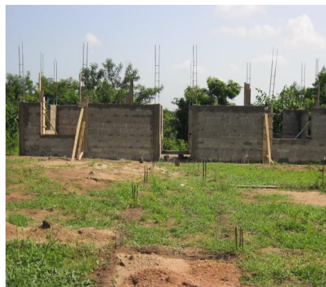
the front room at Ayikuma