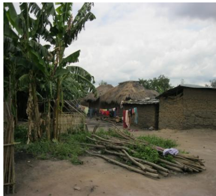
The Ayikuma community that MOP will soon serve

MOP directors Eric Kwame Agoe and Renee Farwell plan to build up and finish two to three rooms and then move in to the unfinished building using the small space as classrooms during the day and dormitories in the evening until the entire building is finished. "Living there will ensure that the work is done as proficiently as possible," stated Agoe.