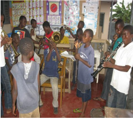
Students in MOP Primary Classes 2 and 3 attend the first day of after school music education classes.

Monday September 12, 2011 Mawuvio's Outreach Programme held their first after school music class. Approximately 15 students attended; all students of Mawuvio's School aged 11-17. The music programme was implemented by MOP director Renee Farwell as another way to encourage learning as well as