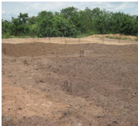
The finished and leveled foundation at Ayikuma Township.

The Ayikuma building project that will soon be the future home and school has begun to take form during the month of September. MOP added a small amount of sand to the filled foundation and then leveled the sand to prepare the building for flooring and bringing up the walls.