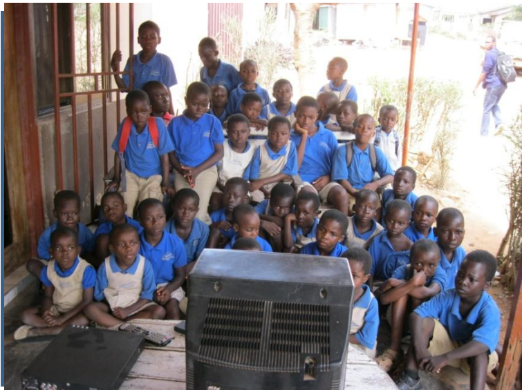
MOP students watch a film during school on Friday afternoon

As of October 1, Mawuvio's Outreach Programme has enrolled 20 new students for the upcoming school year. The new school year began on September 6 th . At the end of the 2010- 2011 Mawuvio's School had 41 students documented in their records. Now a documented 61 students are registered with MOP and all students attend school on a regular basis.