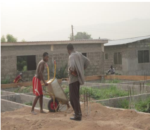
Spring 2011 community members & volunteers worked together filling the building foundation.