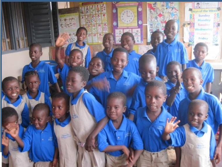
Pictured: Mawuvio's School Students in their new uniforms.